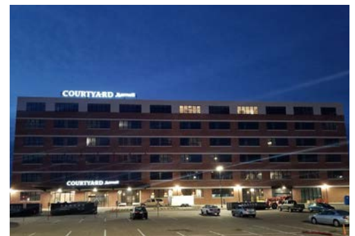
Courtyard Marriott Waterloo Cedar Falls